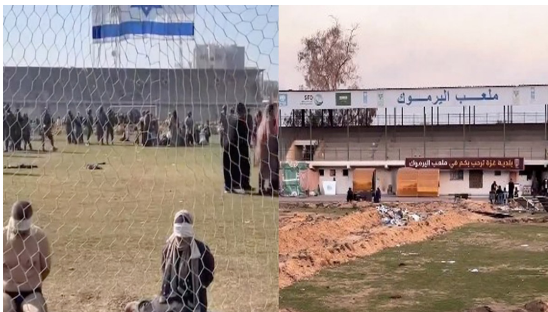
The Yarmouk Stadium in Gaza, from a place bustling with life and love for football, has turned into a location of detention and torture for Palestinians