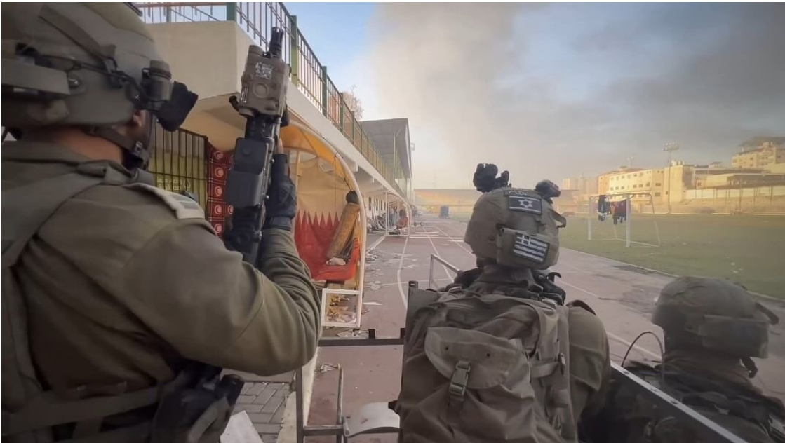
Israeli occupation forces soldiers, acting as mercenaries, inside the Yarmouk Stadium in Gaza.

It is worth noting that the toll of the Israeli war on the Gaza Strip has reached more than 21,000 Palestinian martyrs, the majority of whom were civilians, including children and women. Approximately 56,000 people have suffered various injuries since the beginning of the war on October 7th, according to the latest statistics released by the Palestinian Ministry of Health in Gaza.