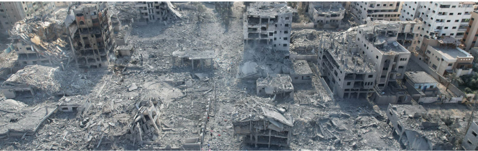
The intensity of attacks and scale of devastation are among the impediments to the delivery of relief aid to those in need across Gaza. The UN Secretary-General has stated that an effective aid operation requires "security; staff who can work in safety; logistical capacity; and the resumption of commercial activity." These four elements do not exist, he warned.